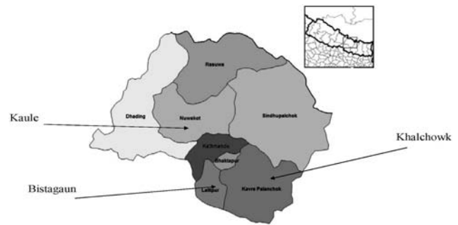
Fig. 2 Map of Nepal and study areas

It is therefore necessary to evaluate the management and economic performance of existing farming systems, but no study has been made to identify the economic value of existing farming system (inter linkage among three components) in the mid-hills especially in relation to the role of each component in the determination of total farm income. In order to fill this gap, this paper attempts to (i) clarify quantitatively the